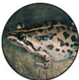
Spotted Marsh Frog Limnodynastes tasmanensis

Frogs commonly mistaken as Cane Toads in New South Wales: