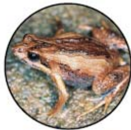
Common Froglet Crinia signifera