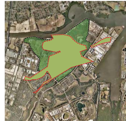
Bicentennial Park, Hornsbusch