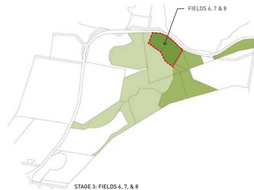
STAGE 3: FIELDS 6, 7 & 8