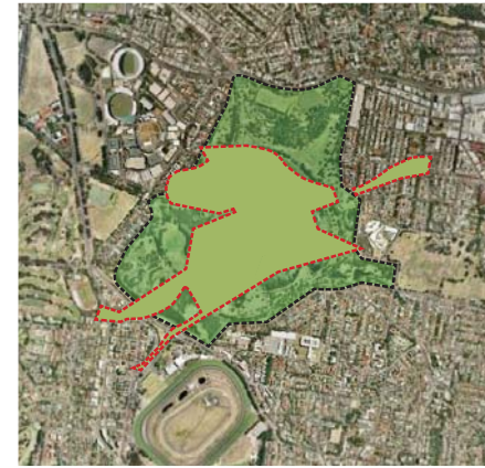
Centennial Park, Sydney