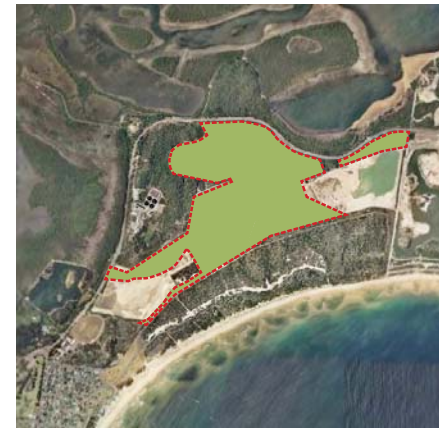
Kurnell open space and landscape rehabilitation site