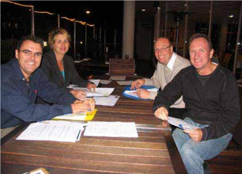
The 2008/2009 Cronulla Chamber of Commerce Executive Committee