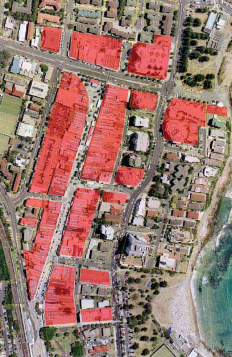
A map of the Cronulla rateable area. ■