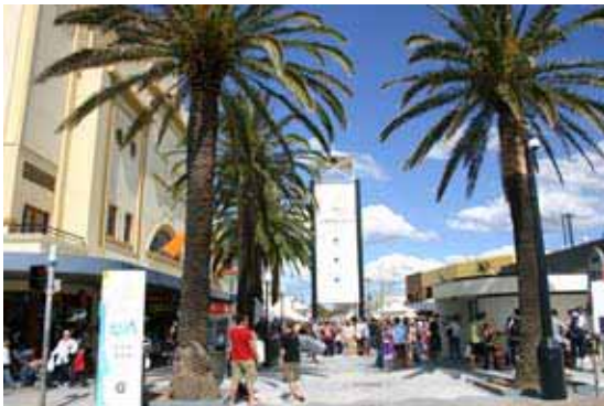
Cronulla Street today

Nowadays, the 'rateable area' comprises of more than 270 businesses. The area has evolved from a traditional local shopping strip to a commercial and tourism centre that also appeals to the leisure and recreational market.