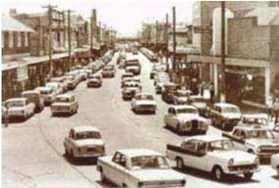
Cronulla Street 1964

Since 1988 commercial property owners within the area have been charged a 'special levy' to be used to promote the area, co-ordinate events and support the businesses within what is termed as the 'rateable area'.